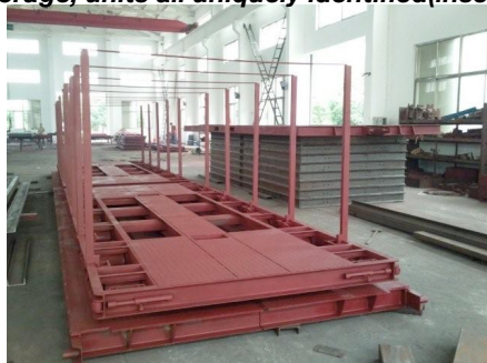
Customized - Optional side supports