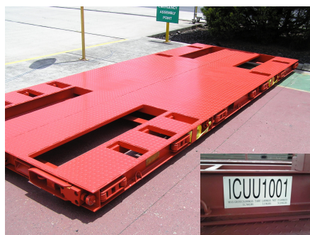
Cavities customized for accessory storage, units all uniquely identified(insert)