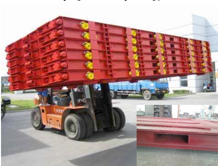
Easily , lifted, moved, and stored, with multi stacking design and lift points