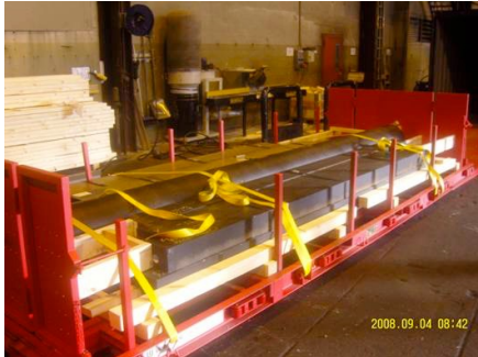
20,000 kilos of steel tooling, $2500 saved, 20'DV instead of OPEN TOPS

email: sales@InnovativeTransportSolutions.com