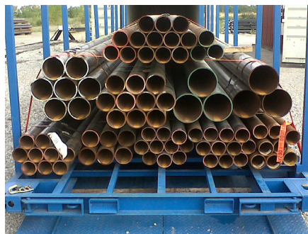
Industrial tubing - Hollow Structural Section