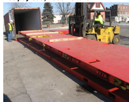
40' Unit flat base, 474 x 90 x 9"s, 66138 Lbs payload capacity, 4800 Lb tare