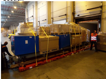
Freight of all kinds consolidated from distribution hub, less handling of