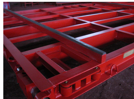
Energy efficient - Steel recyclable bearers replacing lumber