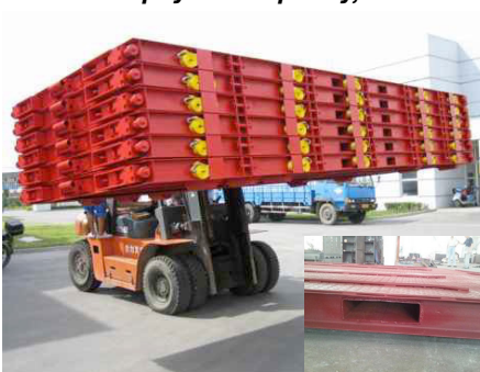
Easily , lifted, moved, and stored, with multi stacking design and lift points