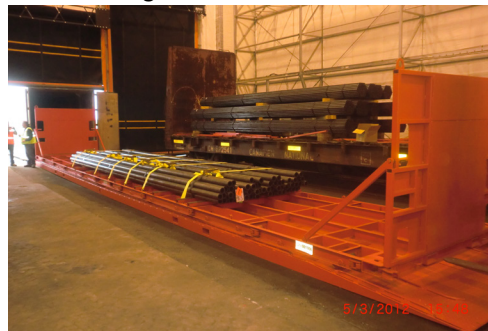
Oil and Energy, avoiding flat-beds for cheaper more secure INTERMODAL MODE of TRANS.