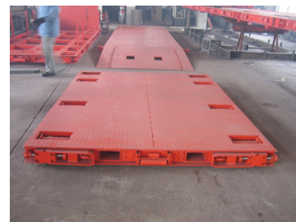
10' Unit -120 x 90 x 5"s, 15000 Lbs payload, Tare weight 1400 Lbs