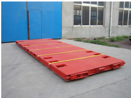
20' Unit flat base, 240 x 90 x 9"s, 52910 Lbs payload capacity, 2750

email: sales@InnovativeTransportSolutions.com