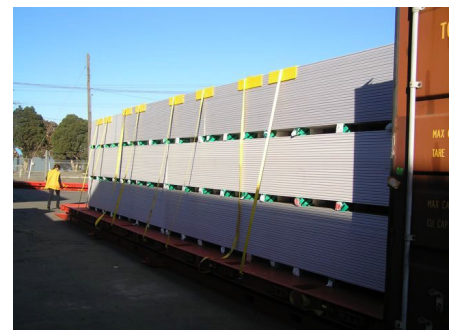
Dry-wall - avoidance of damages & reduction in labor costs, less handling