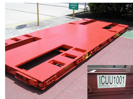
Cavities customized for accessory storage, units all uniquely identified(insert)