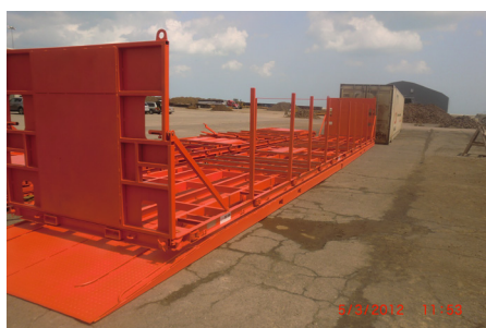
Full Intermodal and domestic 96" wide MTT's with bulk-heads