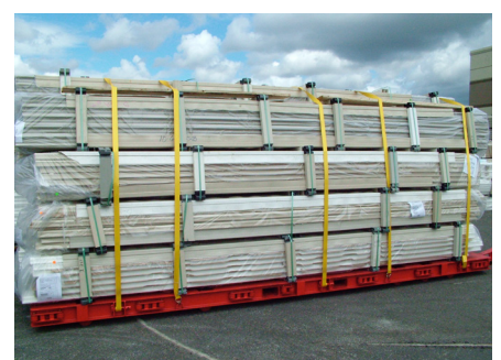
Siding - Moving from truck to rail