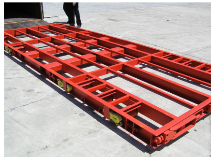
20' Unit bearer, 240 x 90 x 9"s, 52910 Lbs payload, 2336 Lb tare