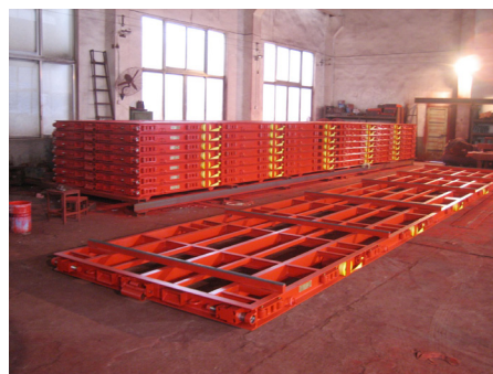
40' Unit bear, 474 x 90 x 9"s, 66138 Lbs payload capacity, 3700 Lb tare