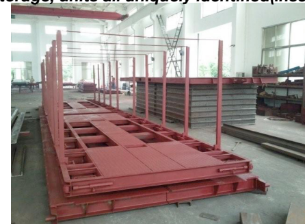
Customized - Optional side supports