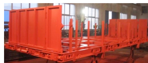
Customized - Fold away bulk-heads, side supports