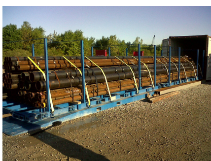
Nothing exposed to the elements