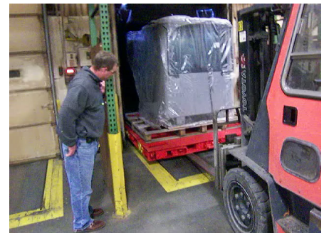
Construction & Agriculture - Earth moving equipment