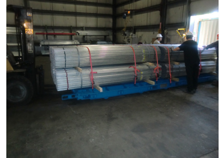
Electrical Conduit - Rail shipments via enclosed containers avoiding flat-beds