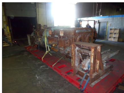
Heavy machinery - Expensive crating avoided