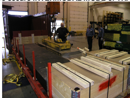
Steel products - 22,000 kilos, special ocean freight & crane equipment avoided