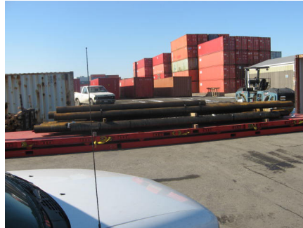
Beneficial at our seaports, less handling & less cost