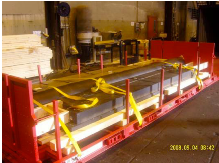
20,000 kilos of steel tooling, $2500 saved, 20'DV instead of OPEN TOPS

email: sales@InnovativeTransportSolutions.com